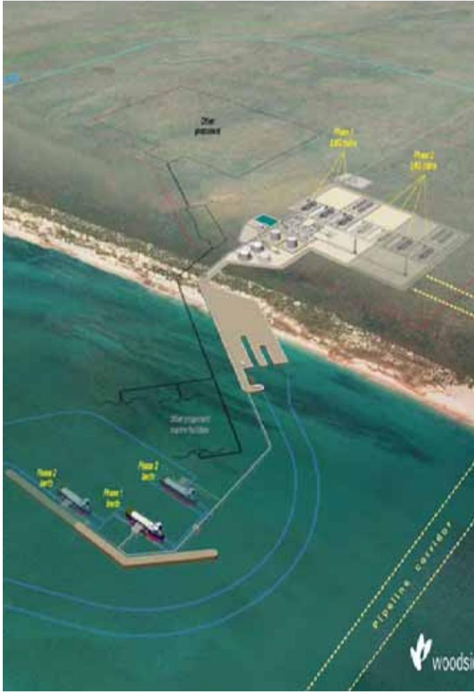
Artist impression – source Woodside Petroleum Limited (WPL), ASX Release dated 14 December 2009, slide 10.